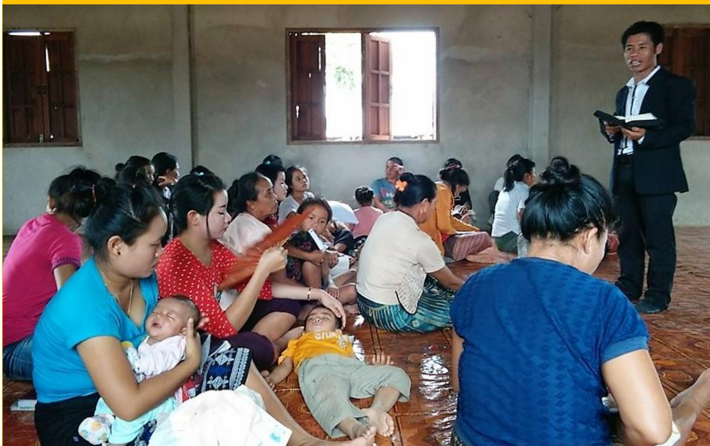
The first Khmu SDA Church in Laos, South Thong Namee, Borikhamxay Province

Thong Namee Village is a very large village of Pakkading District, Borikhamxay Province, just 200 km south of Vientiane Capital. The Adventist Church of Laos has two churches in this village, one for the Hmong and another for the Khmu. Both churches still do not have pastors. They are being cared for by lay leaders.