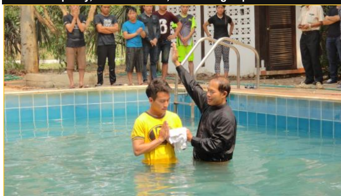
The first Adventist from Phongsaly Province

to their respective provinces. LAF has a plan to start a vocational missionary training program, Lao Adventist Missionary Program (LAMP). We will train local missionaries in trades like sewing, hairdressing, motorcycle mechanic, mobile phone repair, and so on. Equipped with these skills and rooted in solid biblical understanding we believe that they will become tent making missionaries in their own homeland.