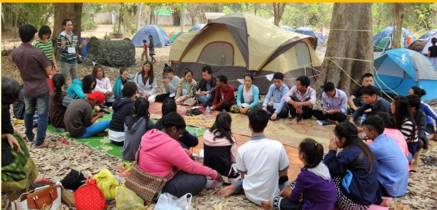
A bible study station at the Vientiane Lao Youth Camp

A few years ago, it would be unthinkable to hold a Christian youth camp in Laos. Each year, LAF used to send a few of its youth, as many as it could afford, to join youth camps in Thailand. Since 2015, LAF was able to hold its own youth camp in Laos. Thanks to a few privately sponsored graduated young pastors from Mountain View College, Philippines, who have just recently joined us since 2014. These pastors came with good experience in youth ministry and were keen to put into practice what they had learned. In addition, we are grateful to our foreign members who are working in Laos for bringing their expertise in Youth Ministry to help out at the camp.