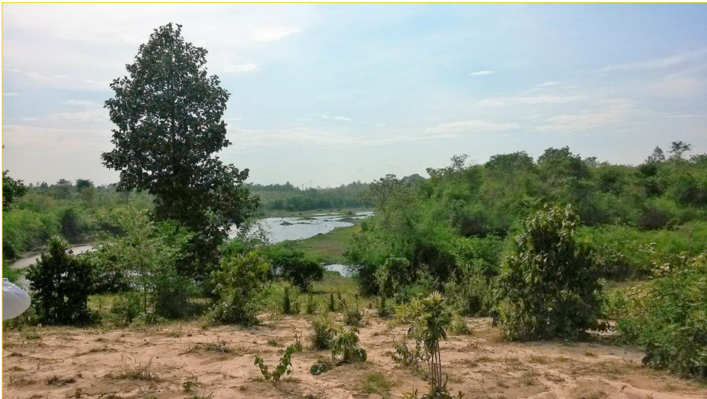
The 25 hectare (62 acre) Lao Living Waters Academy Land as seen during the driest season of the year

leaders of the church in the future. At the same time, other young people can come for missionary vocational training. The idea of setting up an academy far away from the cities to provide protection for our young ones from the temptations of the cities and train them up in the way of God is supported by our church prophet and pioneer, Mrs Ellen G. White. She said, "Let men of sound judgement be appointed, not to publish abroad their intentions, but to search for such properties in the rural districts, in easy access to the cities, suitable for small training schools for workers, and where facilities may also be provided for treating the sick and weary souls who know not the truth. Look for such places just out from the large cities, where suitable buildings may be secured, either as a gift from the owners or purchased at a reasonable price by the gifts of our people. Do not erect buildings in the noisy cities."-- Evangelism , 77 (1909).