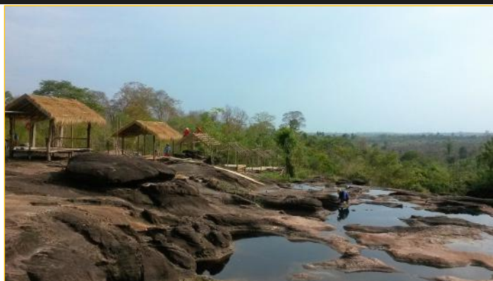
The waterfall near the academy land (driest season)

This piece of land, 25 hectares (62 acres) is large enough for many Adventist institutions: academy, health centre, vocational & missionary training centre, agricultural school, retirement vil-